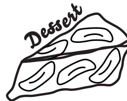
HONEY APPLE CAKE

Roasted squash filled with festive herbed rice